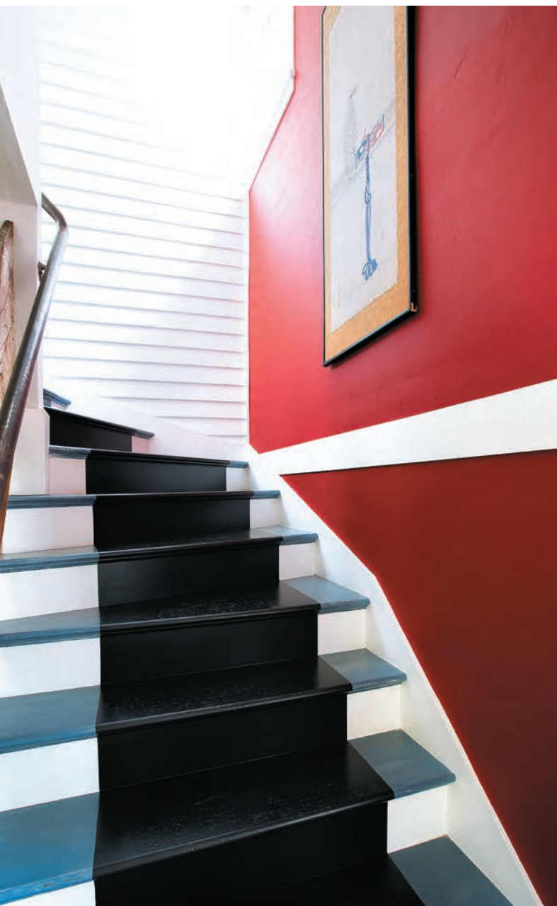
Gathering Place (ABOVE) A red Cappellini sofa and bright blue coffee table from Bloomfield enliven the family room in the new barn. The white chair is from Design Within Reach, and the black side tables and light fixture are from a local antiques store. The 1960s Danish teak dining set is a family heirloom with the chairs featuring custom leather upholstery by Fawn Galli Interiors. Graphic Design (LEFT) In lieu of a carpet runner, the designer had the back staircase painted to make it durable and give it personality. See Resources.