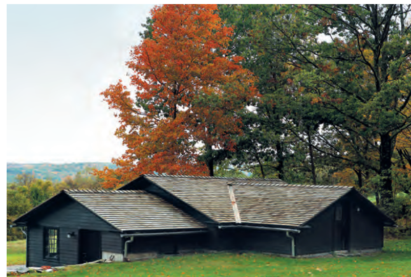
Screened In (THIS PAGE, CLOCKWISE FROM TOP) A porch addition to the original white gabled structure created a welcome summer amenity on the west side. The existing garage got a new roof and a fresh coat of black paint to match the barn. Bifold doors open to the lower-level family room, which is a favorite hangout for the owners and their sons. Al Fresco Dining (OPPOSITE PAGE) The new screened-in porch is furnished with simple director's chairs from RH and a pair of 19th-century Swedish drop-leaf tables from M. Naevé Antiques. A 1920s US Industrial Pendant supplies lighting. See Resources .