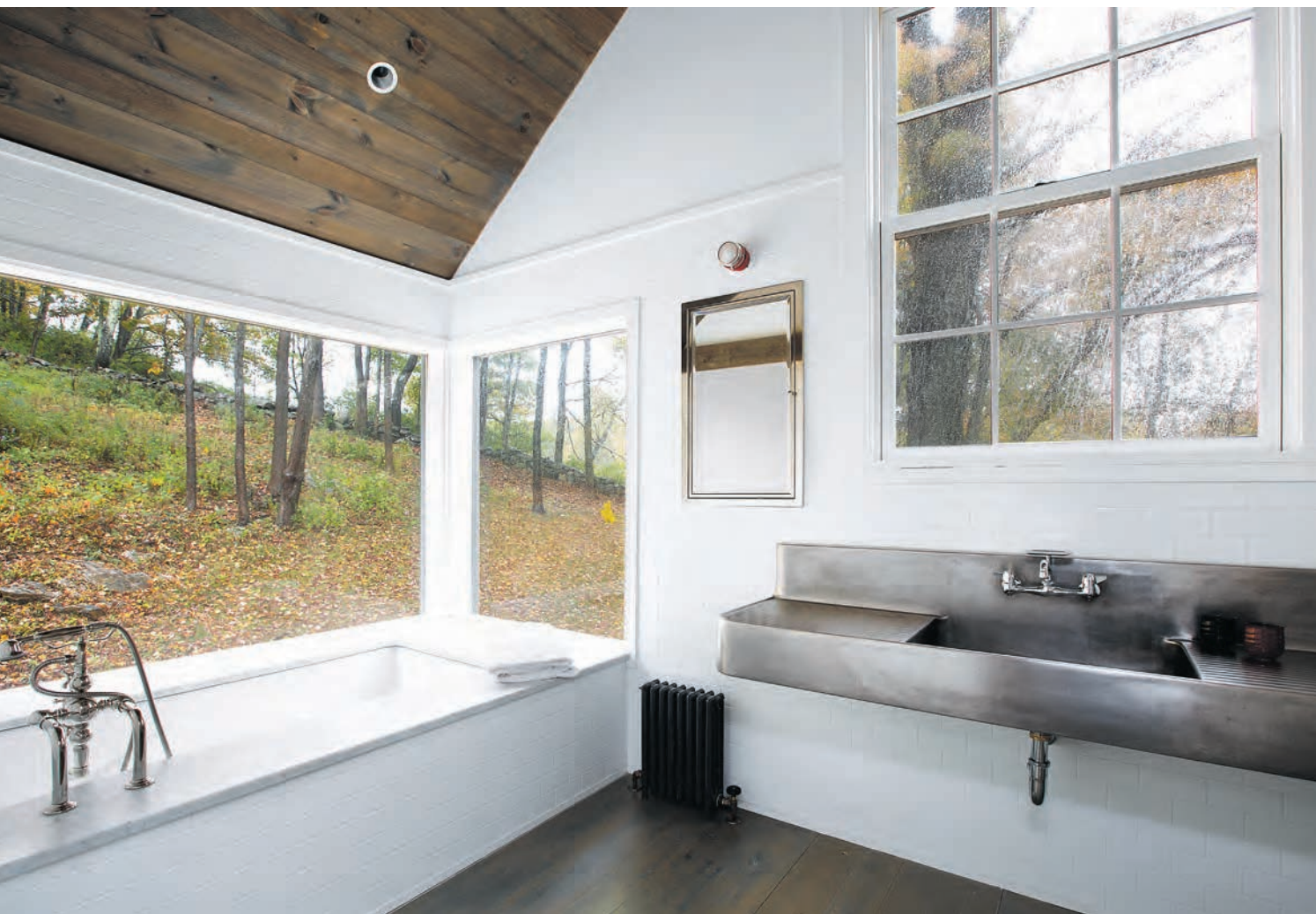
Simplicity Speaks (ABOVE) In the master bedroom, the 1950s ceramic top coffee table is French, and the director's chairs are from RH. A vintage map of Venice hanging above the bed takes the place of a headboard, and the mesh disc on the wall is an art piece by Jan Baracz. Snake wall sconces are from Fabbian. Red sconces are by Desdirot. Utilitarian Bath (LEFT) With a Kohler tub perfectly situated to enjoy the view, the master bathroom features a vintage Montel sink from Wyeth fitted with a Harrington Brass wall-mount faucet. See Resources.